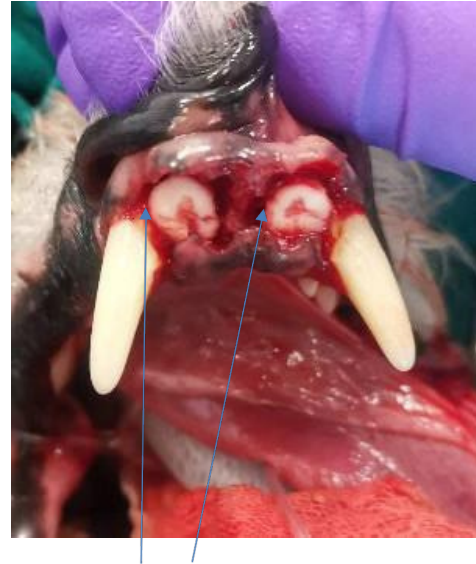
ReGum TM Vet conic version

ReGum TM Vet was used to promote periodontal attachment gain on the mesial side of both canine teeth.